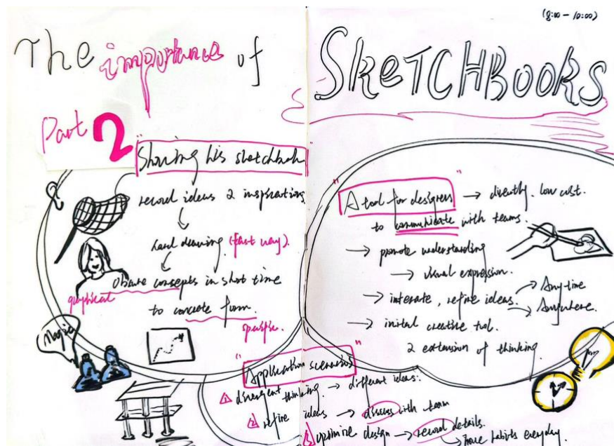
Fig2: my mindmap on Part 2 "The importance of sketchbooks".